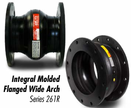
Integral Molded Flanged Wide Arch Series 261R