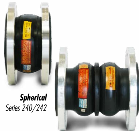
Spherical Series 240/242