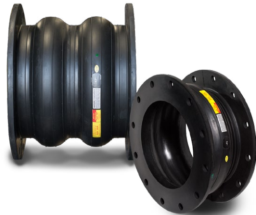
Integral Molded Flanged Wide Arch Style 261R & 262R