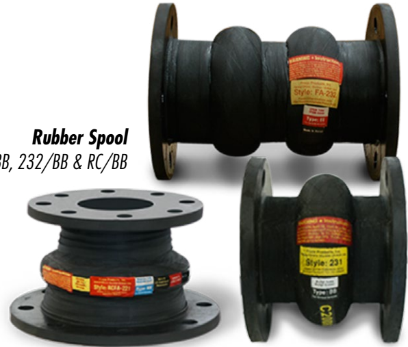
Rubber Spool Style 231/BB, 232/BB & RC/BB